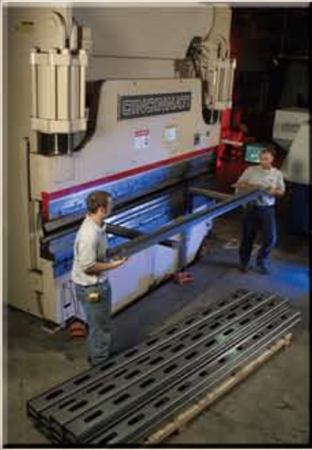
350 Ton CNC Forming