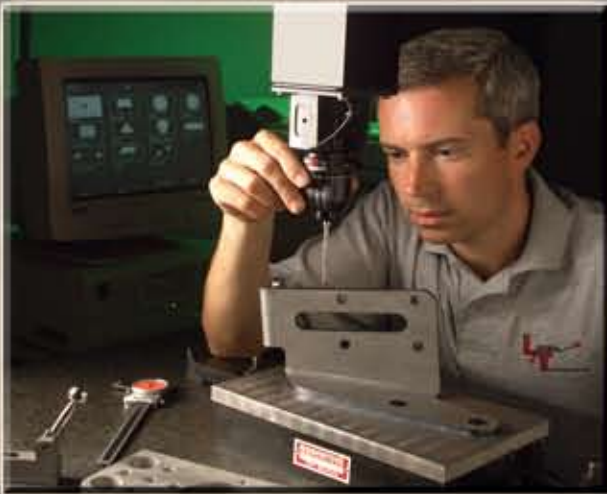
CMM Quality Control