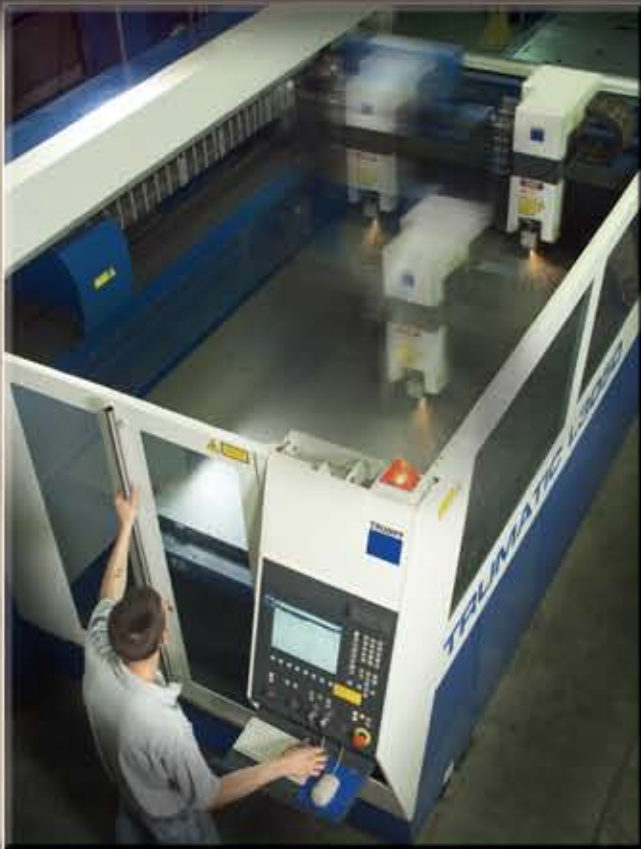
CNC Trumpf Sheet Laser