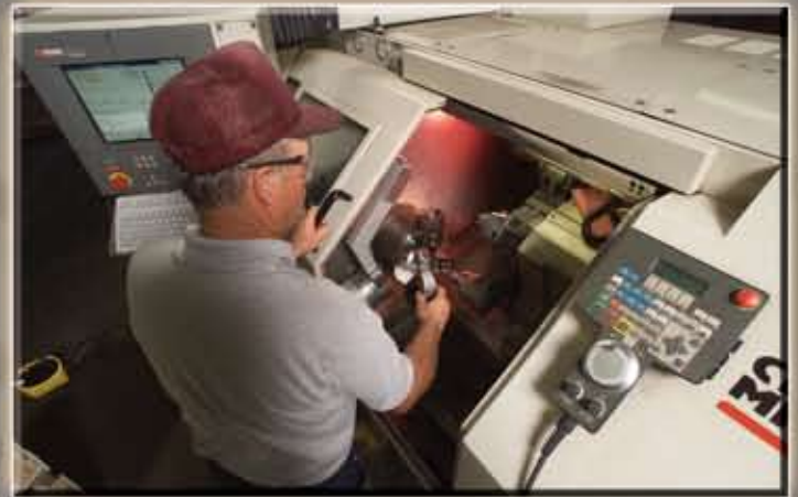
CNC Turning Center