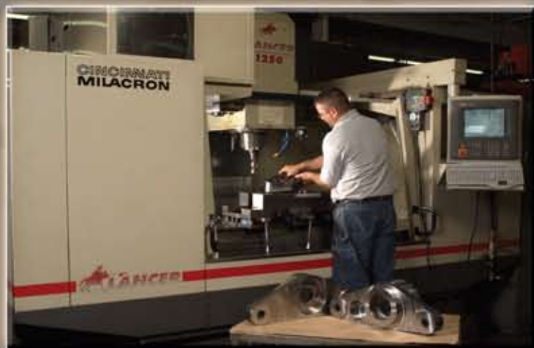
CNC Machining Center