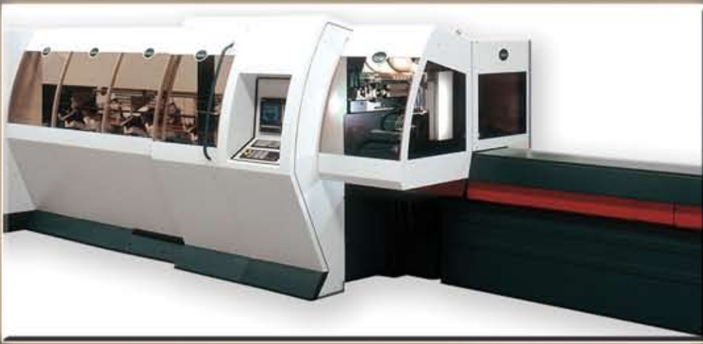
CNC BLM Tube Laser