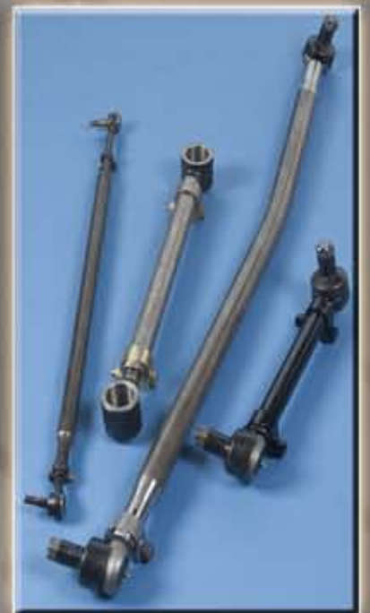
Drag & Stabilizer Links